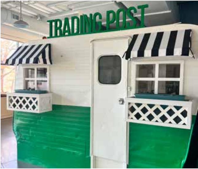
Day Camp Trading Post ↑

No, adding Trading Post funds to your camper's registration is not mandatory. However, we find that campers love to purchase a keepsake from the Trading Post to commemorate their time at camp.